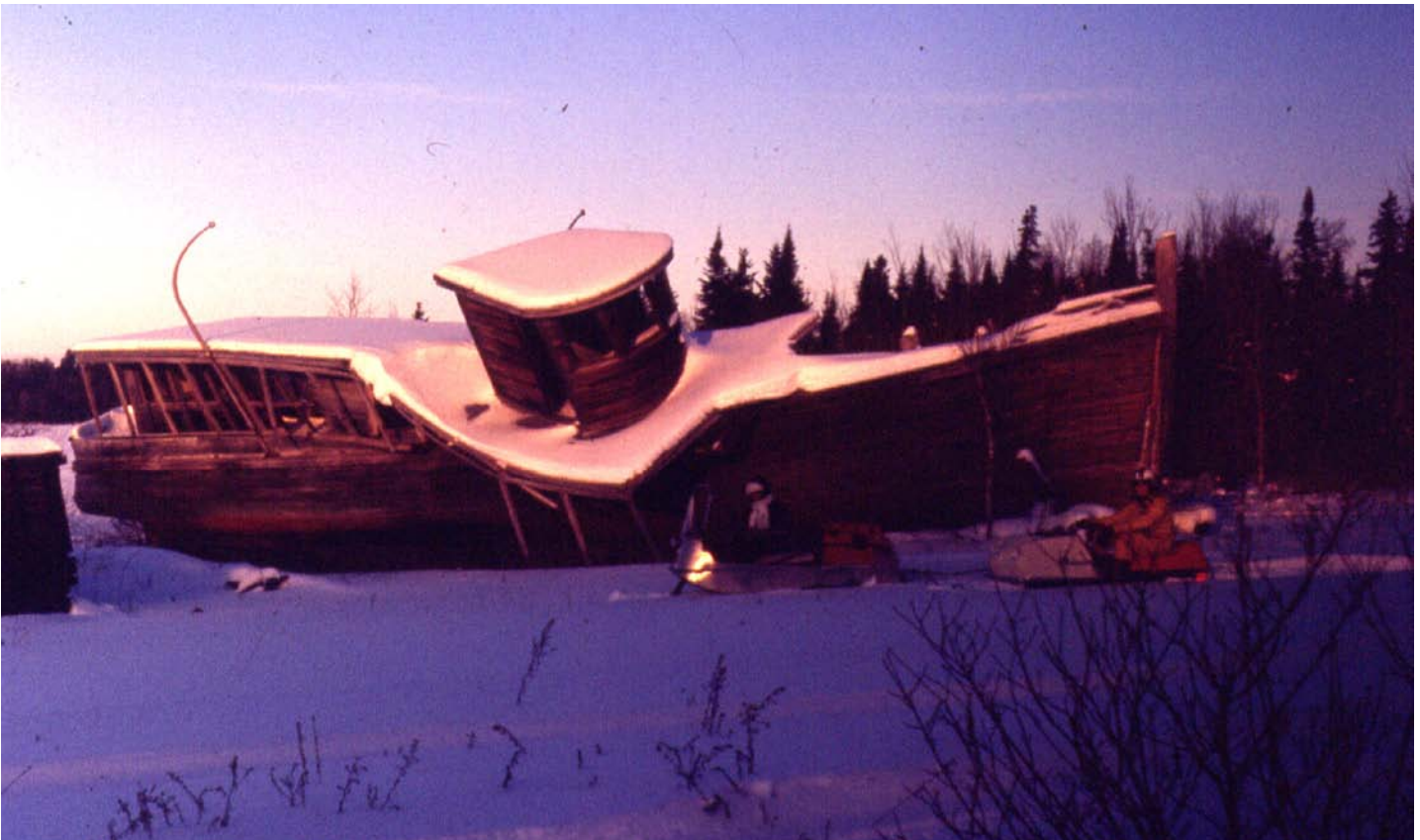
Wapesi (1973)